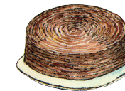
Chocolate cake 9.5in $130.00 7in $90.00