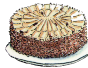
Mocha cake 9.5in $120.00 7in $84.00