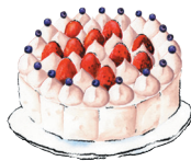
Queen of cake 9.5in $170.00 7in $119.00

Please make a reservation at least 2 days in advance and pay at the time of reservation.