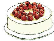
Strawberry cake 9.5in $150.00 7in $105.00