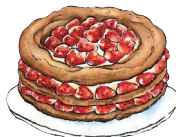
Strawberry mille-feuille 9.5in $150.00