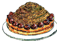
Waguri tarte 9.5in $170.00