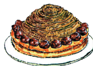
Waguri tarte 9.5in $170.00